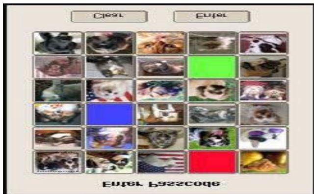
Figure. 1- Cats and dogs photos [5][13]

Jensen et al. [5] proposed a graphical password scheme based on “picture -password ” designed especially for mobile devices such as PDAs. Throughout the password creation, the user has to select the theme first (e.g. sea and shore, cat and dog and etc) which consists of thumbnail photos. The user then selects and registers a sequence of the selected thumbnail photo to form a password (Fig.1). The user needs to recognize and identify the previously seen photos and touch it in the correct sequence using a stylus in order to be authenticated. However, as the numbers of thumbnail photos are limited only to 30, the size of the password space is considered small. A numerical value is assigned for each thumbnail photo and the sequence of selection will produce a numerical password. This numerical password is shorter than the length of textual password. To over-come this problem a user can select one or two thumbnail photos as one single action in order to create and enlarge the size of the password space. However, this will make the memorability of the created password become more complex and difficult.