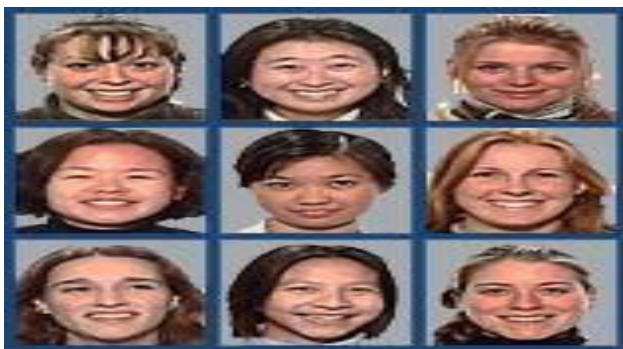
Figure. 2- Passfaces TM

Based on humane recalling ability Real User Corporation has developed their own commercial product named Passfaces TM [6][13][14]. Basically, Passfaces works as follows, users are required to select the previously seen human face from a grid of nine faces one of which is known while the rest are decoys (Fig. 2). This step is continuously repeated until all the four faces are identified.