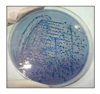
Figure 2. Growth of S. mutans on MSKB culture media in caries active group.