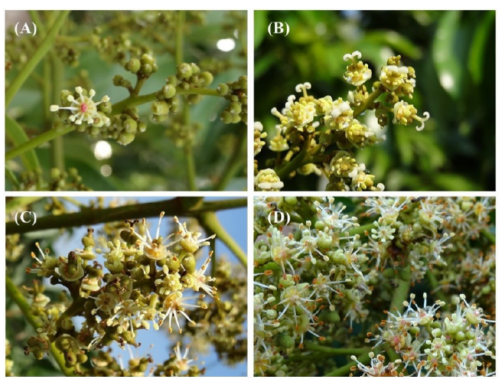
Figure 1. Floral sex expression during 'Yu Her Pau' litchi blooming. (A) M1 stage, anthesis of first wave of male flowers; (B) F stage, anthesis of female-functioning hermaphrodite flowers; (C) M2 stage, the male-functioning hermaphrodite flowers anthesis following the F stage. M2 followed by M1-like flowers might lead to confusion within some panicles due to gradually degenerated pistil among flowers (D).

Along a single inflorescence, litchi flowers bloom in a specialized series: firstly, the male ( Figure 1A ), then the female (hermaphrodite flower functioning as female, Figure 1B ), and the male ( Figure 1C ) again <sup>[12]</sup>. Occasionally, blooms start with female flowers without male flowers as stated above, this is mostly observed on shoots accumulated less cool temperatures <sup>[7,13]</sup>. Comparisons of morphological and functional difference of the prior bloomed male flowers (so called M_1 ) with the later ones (hermaphrodite flower functioning as male, so called M_2 ) have been discussed in previous reports <sup>[14]</sup>. Nevertheless, M_1 and M_2 are easily confused just before the recurrent flowering of female flowers emerge, by chance, in some cultivars, like 'Yu Her Pau' (personal observation, Figure 1D ).