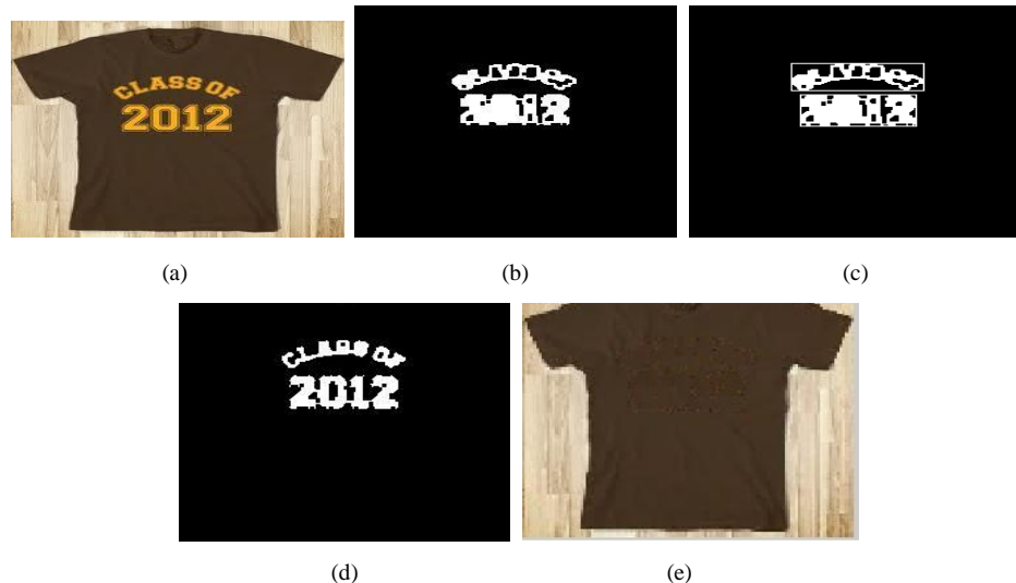
Fig. 4 Text Detection and Inpainting (a) Original image (b) Image after applying first set of criteria (c) Image after applying second set of criteria (d) Image mask (e) Inpainted image using patch size 5 x 5 and search window size 81 x 81

Above Figures shows the results of text detection from an image and inpainting by using exemplar based Inpainting algorithm. Figs. 2, 3, 4 (a) shows the original image. (b) is the image obtained by applying first set of criteria. All objects whose area greater than 10000 and filled area greater than 8000 are eliminated and major axis lengths are in between 20 to 3000 are considered to be text. Still, some small non-text objects are detected. To eliminate small objects, connected component labelling is applied to the resultant image.(c) represents text detection by applying second set of criteria which eliminates all the objects whose area is less than 300 and filled area is less than 500.