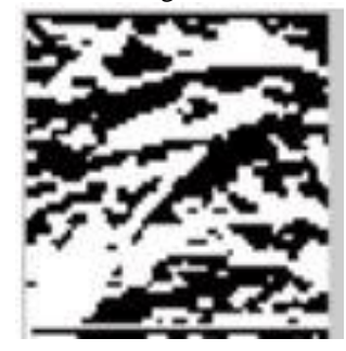
Figure 3.2 Feature extraction by sobel edge detection method on palmprint image

The Sobel results are threshold according to the value sign is the resized enhanced palmprint images for the same individual while (c) is the resized enhanced images for another user. Fig. 3.2 shows the Sobel Code for the resized enhanced image.