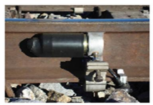
Fig.1 Ultrasonic Broken Rail Detector

NDT techniques have resulted in a number of tools for us to choose from. Among the inspection methods used to ensure rail integrity, the common ones are ultrasonic inspection and eddy current inspection. Ultrasonic Inspections are common place in the rail industry in many foreign countries. It is a relatively well understood technique and was thought to be the best solution to crack detection [6]. The Ultrasonic Broken Rail Detector system is the first and only alternative broken rail detection system developed, produced and implemented on a large scale. By using ultrasonic Broken Rail Detector system railway operators will have the benefit of monitoring rails continuously for broken rails without human intervention. This will contribute to ensure that the people does not suffer losses as a result of train derailments[10].Ultrasonics Control Area Network only inspect the core of materials; that is, the method Control Area Network not check for surface and near-surface cracking where many of the faults are located[6].