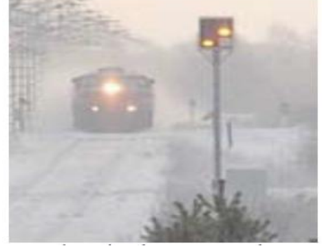
Fig.3 Signal Lamp Example