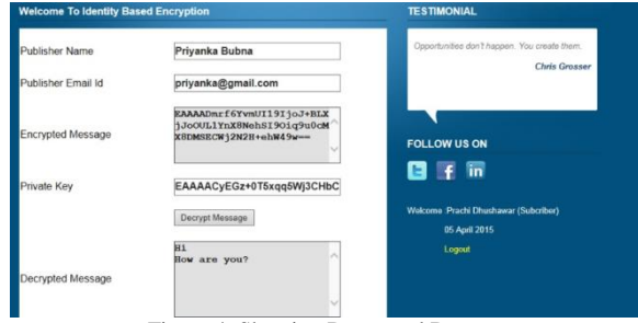
Figure 4. Showing Decrypted Data

Subscriber give respond to publisher, if credential associated with subscriber match with credential of event and key of publisher. After that subscriber has to login for decryption of event. Subscriber request to key server for private key to decrypt the event. Private Key that was generated by key server for subscriber is nothing but encrypted data of encrypted event of publisher and encrypted form of public key that was generated for publisher to encrypt the message, for this vernam cipher algorithm is used. Subscriber upload the certificate that was generated by publisher for subscriber and then subscriber decrypt the event by using private key if digital signature were match.