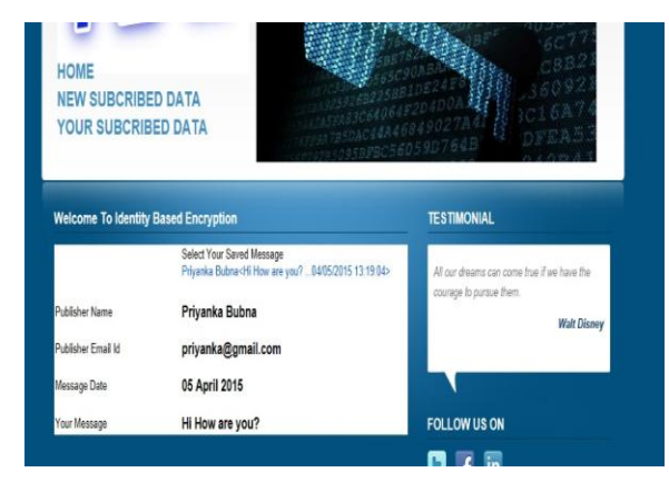
Figure 5. Window Showing detail of Decrypted Data

Subscriber is able to see all the detail related to event. Subscriber knows who send the event and at what time and date event was sended by publisher. Subscriber can decrypt new data or decrypt previous data. In this paper, Certificate based encryption is used that was secure all event from all type of attack and add digital signature into the generated key. Certificate based encryption used for providing all type of security mechanism. Certificate Based Encryption save event from man in middle attack that was rare in wireless network.