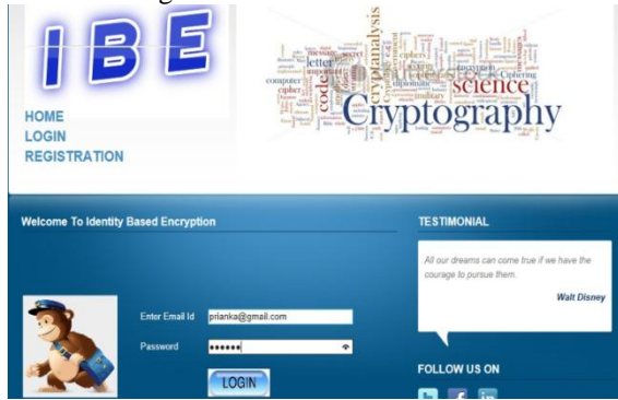
Figure 2. Showing Registration phase for Pub/Sub along with login phase

successfully registered as publisher or subscriber. Publisher and subscriber get credential according to its event. As user get credential for its event, user is able to do login.