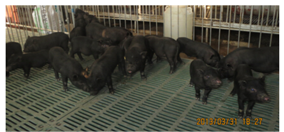
Figure 1. Obtained partly piglets derived from the fibroblasts of Diannan miniature pig.

Cloning efficiency (%) = No. of cloned piglets / No. of transferred embryos \times 100.