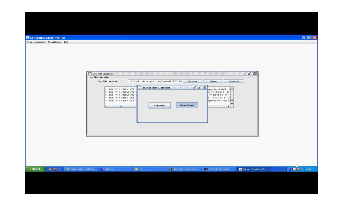
Fig 2: Log based profile