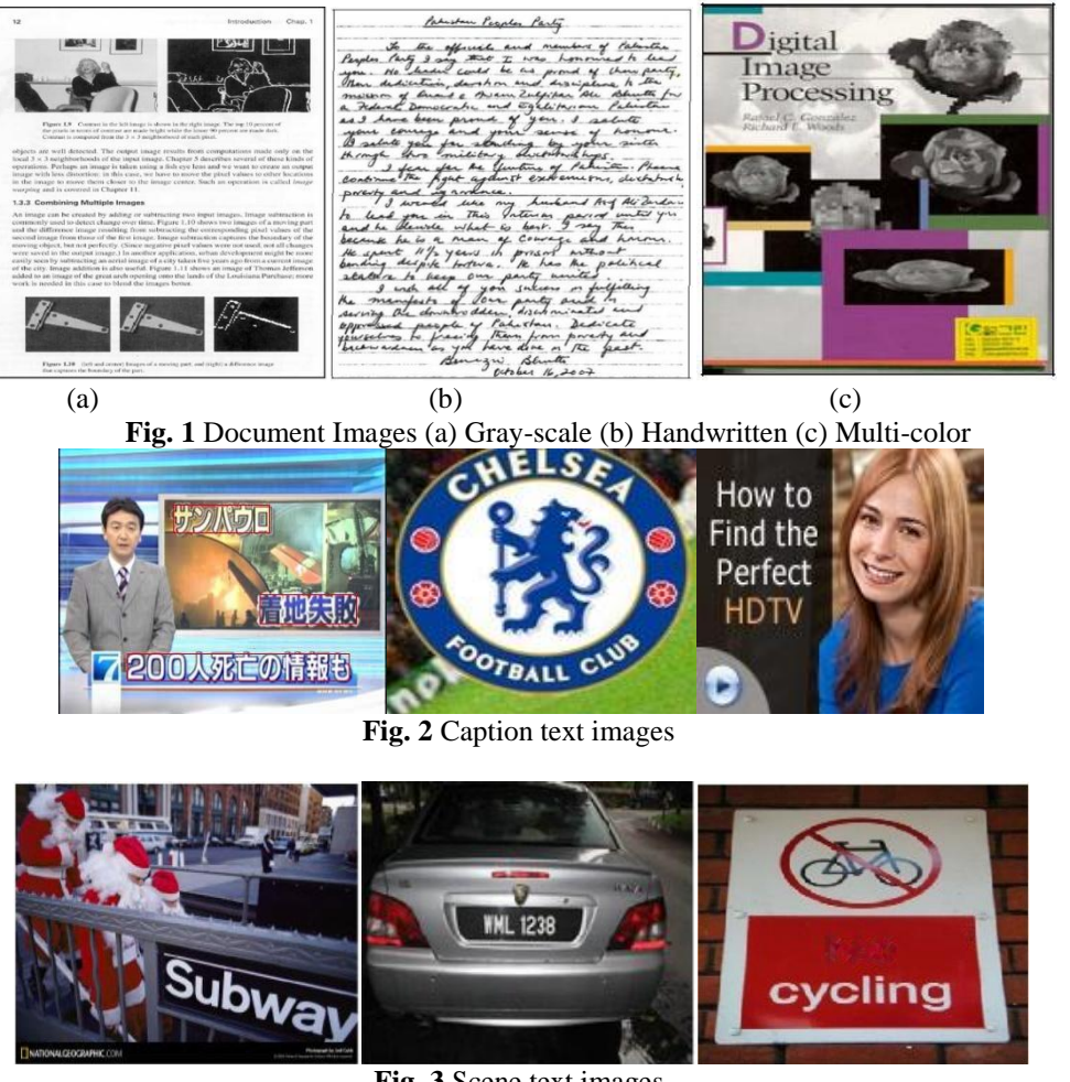
Fig. 3 Scene text images