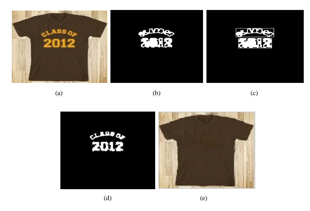
Fig. 4 Text Detection and Inpainting (a) Original image (b) Image after applying first set of criteria (c) Image after applying second set of criteria (d) Image mask (e) Inpainted image using patch size 5 x 5 and search window size 81 x 81

Fig. 3 Text Detection and Inpainting (a) Original image (b) Image after applying first set of criteria (c) Image after applying second set of criteria (d) Image mask (e) Inpainted image using patch size 5 \ge 5 and search window size 81 \ge 81