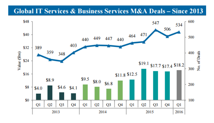
Figure 2: S&P capital IQ and industry research.

The below analysis on Industry research shows how the Global IT services and Business Services increase in Merger and Acquisitions deals and the value of those closed deals since 2013 [5]. There is almost 4 times growth in 2016 compared to 2013 and this shows how companies are making benefits through mergers and acquisitions.