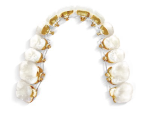
Figure 3. Incognito appliance.