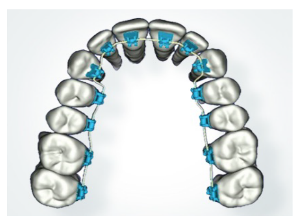
Figure 5. Suresmile system: Customized archwire.

Sure Smile (OraMetrix, Inc., Richardson, TX, USA) carries the option to integrate CBCT images to create a precise virtual target setup and it utilizes individualized robotically bent archwires in the final stages of orthodontic treatment to create a customized lingual appliance <sup>[27,32]</sup>. With Sure smile, the operator may use any conventional lingual brackets with their fully customized archwires ( Figure 5 ). First, optical or CBCT scan is submitted to the lab to create a digital model followed by creating a diagnostic setup as per the doctor's prescription. After stock lingual brackets are bonded, the case is levelled and aligned as usual. Second intra oral scan or CBCT is taken to record the position of teeth and brackets to create a therapeutic set-up based on doctor's prescription. Once the doctor approves it, customized archwires are robotically bent in all the three planes to accomplish the desired end result.