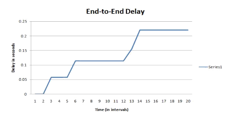
Figure 2. End-to-end latency.

The transmission delay has been recorded nearly at 0.25 seconds or 250 milliseconds at maximum, which is the highest value reached after the network convergence. The proposed model has been recorded for 200 seconds, where each interval of 10 seconds has been marked for the recording of the elapsed time. The proposed model can be declared efficient on the basis of both of the performance parameters, where it has shown the high-end performance for the smart city environments ( Figure 2 ).