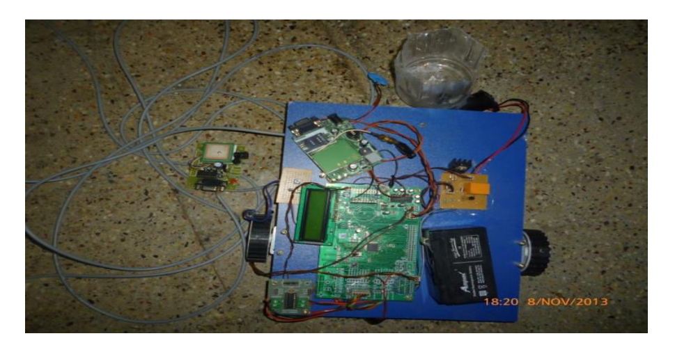
Fig: 3 Proto type of the proposed architecture

A. The below figure shows the prototype of the Design and Implementation of supervising the Robot by using SMS.