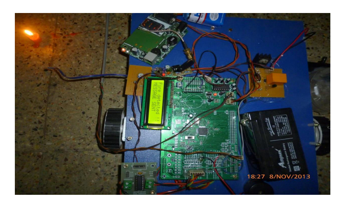
Fig: 5 Controllers displaying the fire detection and the message has been sent

C. The below figure shows the fire is detected & message has been sent on the display. this can displayed only when the Robot detected the location of the fire and longitude and latitude values of the corresponding fire detected area are sent to the user through GSM module.