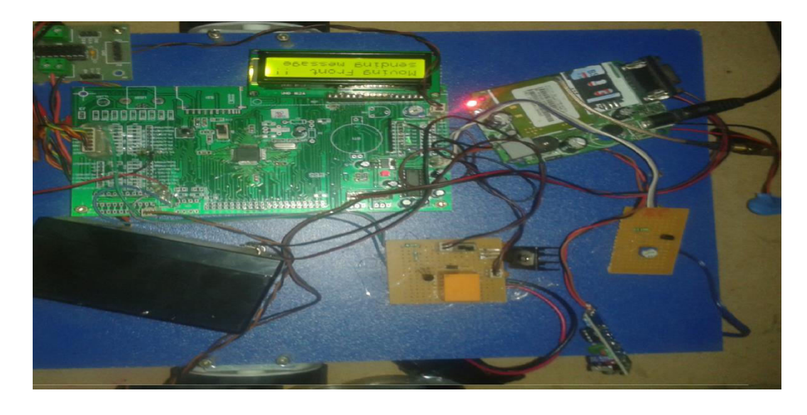
Fig: 7 Robot moving front Direction

E. The below figure shows the robot is moving to the front direction towards the fire located area and also at the same time the message like 'Robot moving front' also sent to the user mobile.