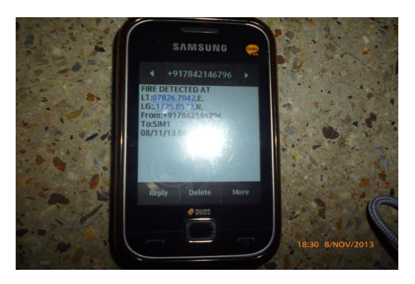
Fig: 6 Message received by user mobile

D. The below figure shows the message about the longitude and latitude values of the fire detected area that was sent to the user mobile from the stored number in the Robot controller section through the GSM module.