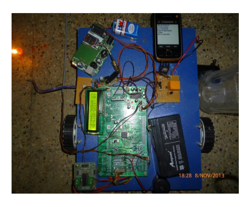
Fig: 4 Robot detects the fire

C. The below figure shows the fire is detected & message has been sent on the display. this can displayed only when the Robot detected the location of the fire and longitude and latitude values of the corresponding fire detected area are sent to the user through GSM module.