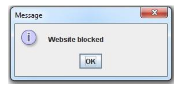
Figure 5: websites blocked message window

As the websites is detected as phishing or unsafe then our program will blocked it for safety purpose. Figure 5 is an example of testing results.