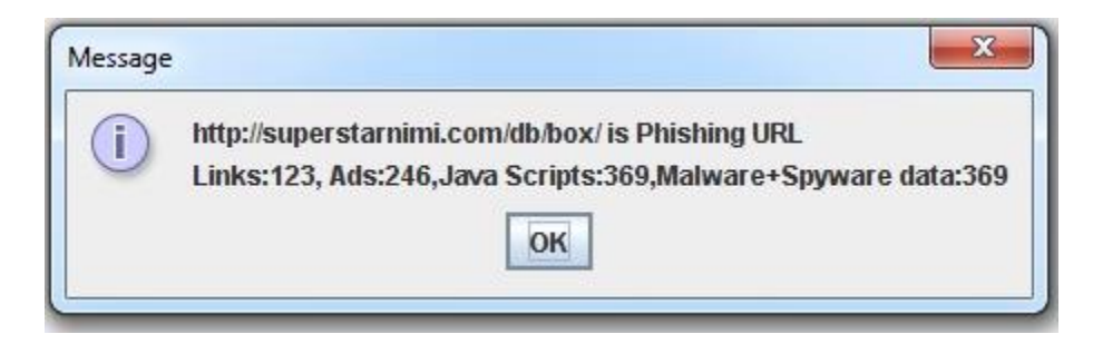
Figure 4: The program checking result window for phishing websites

The Second window: The websites is phishing websites detected on the basis of websites characteristics. As the characteristics that we are used for detecting the websites shows that the site will be phishing as shown below. As the external links in that websites is 123, number of adds on that sites is 246, java scripts available in that sites are 369 and malware and spyware data is also 369 on that websites, all these characteristics show that the input website is the phishing site Figure 4 is an example of testing results.