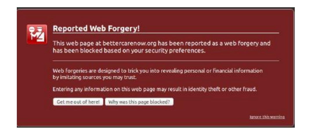
Figure 6: Alert message

On this basis it will show that the websites that our system detected as phishing is actually phishing websites as shown in the above figure 6.