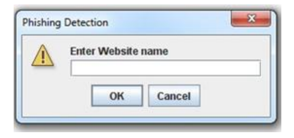
Figure 1: Phishing detection program main window