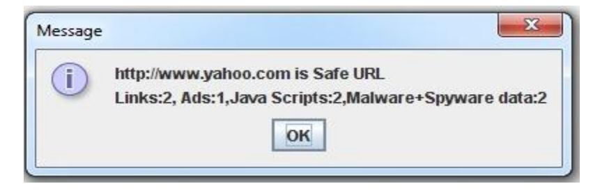
Figure 3: The program checking result window for safe websites

The First window: The websites is safe websites detected on the basis of websites characteristics. Figure 3 is an example of testing results.