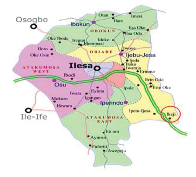
Figure 1. A Nigerian map showing Ikeji, where Joseph Ayo Babalola University is located.

Nephrolepis exaltata was collected from the bank of the Ariran River, flowing through Joseph Ayo Babalola University ( Figure 1 ), which is located very close to the University's main-generator house. Plant samples were obtained with the aid of a hand trowel ( Figure 2 ). A sample of the polluted water was also collected for heavy metal analysis.