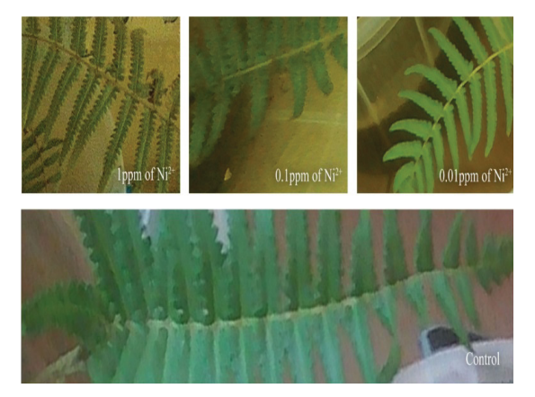
Figure 5. Visible Chlorosis and necrosis of Nephrolepis exaltata.

after the 60 days treatment. This was more evident as other ferns in the same group had similar effects. Ferns grown in 1 ppm showed a little more chlorotic and necrotic effects than ferns grown in 0.1 ppm and 0.01 ppm respectively. The chlorotic effect of the fern grown in 1 ppm of Nickel is however shown in Figure 5. Ferns grown in 0.1 ppm showed more chlorotic effects than necrotic effects. However, the necrotic effect on some of the ferns grown in 0.1 ppm is also shown in Figure 5 . Ferns shown in 0.01 ppm of Nickel only caused little effects on the fern. The In the study by <sup>[18]</sup>, the symptoms illustrated in Figure 1 of the work, clearly showed that needles of the pine seedlings exposed to fluoranthene (FLU) and Phenanthrene (PHE) have a high degree of Chlorosis and reddish-brown necrosis compared with the control treatment.