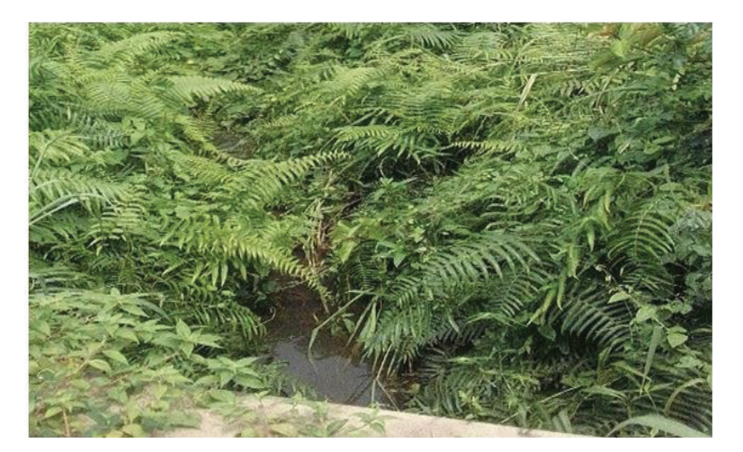
Figure 2. Site of collection of Nephrolepis exaltata in Joseph Ayo Babalola University.

Figure 1. A Nigerian map showing Ikeji, where Joseph Ayo Babalola University is located.