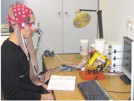
Figure 1: The experimental set-up.

The subject, after the standard 30min BBCI train- ing procedure, was instructed to type at a virtual keyboard shown on a computer monitor. Its layout was based on the QWERTY arrangement, keeping only the letters, 'space' and 'delete' keys. The subject was asked to focus on the letter he wished to type, and while doing so, to imagine a left handed movement. When this movement imagination was detected, the letter being fixated was added to the sentence being typed, which is shown on the screen, slightly below the keyboard. A key press event blocked the BCI for the next 1s. The dimensions of the keys were under1.5x1.5cm except space and delete which were 4cm wide. The distance from eye to screen was roughly 60cm. The cursor was visible and the screen also showed a horizontally moving ball providing feed- back of the BCI classifier state to the subject.