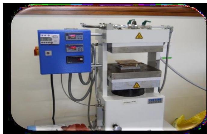
Figure 2: Fortune TH 400 hydraulic press