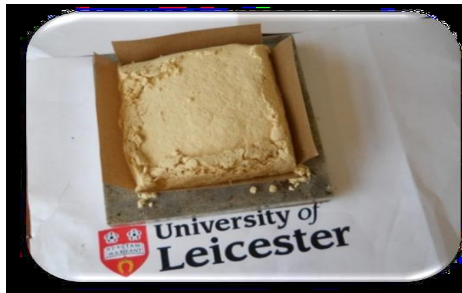
Figure 1: Sample laden plate frame

The mixture (sandwich) was then placed in oven at 70°C for one hour. The mixture was then placed between two copper plates lined with silicone sheet and with a 2 mm copper separator with a 10 cm square aperture (figure 1). The sandwich was then placed in a Fortune TH 400 hydraulic press (figure 2) and a force of 100 kN was placed on the sample for 10 minutes at 140 °C. The sample was then cooled back to room temperature in 5 minutes in the press with the force still applied.