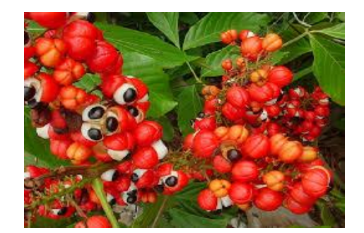
Figure 1. Caffeine plant.