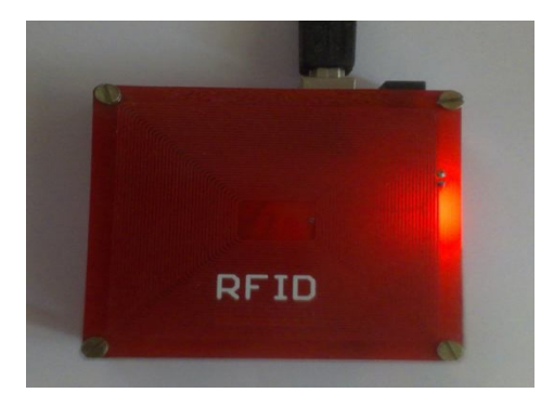
Figure 2. A RFID Reader with USB Cable

In LibRFID project developed our own module using RFID EM-18 Module with USB cable as a wired option to send the data to our Software when we swipe the RFID IDs and RFID Tags. Following is the Diagram of final developed RFID reader