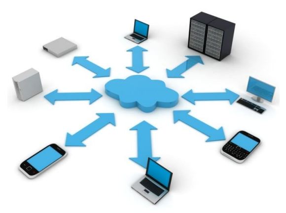
Fig. 1 Cloud Computing

Department of CSE, JayShriram Group of Institutions, Tirupur, Tamilnadu, India on 6<sup>th</sup> & 7<sup>th</sup> March 2014