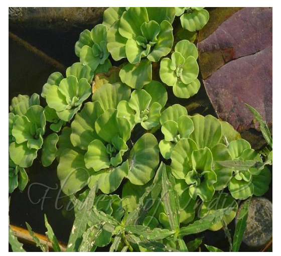
Pistia stratiotes (Akayat-tamarai)

The Pistia Stratiotes Leaves (Akayat-tamarai) collected from nearby Thiruvarur district was activated around 1200°C in a muffle furnace for 5 hrs the it was taken out, ground well to fine powder and stored in a vacuum desiccators.