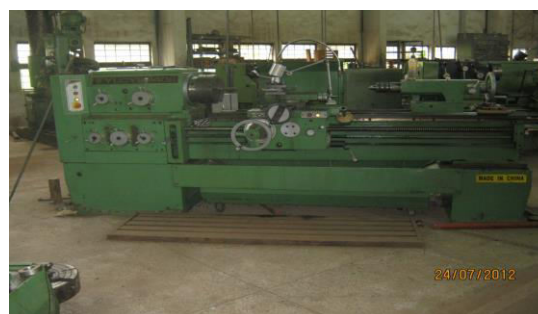
(b) Lathe Machine