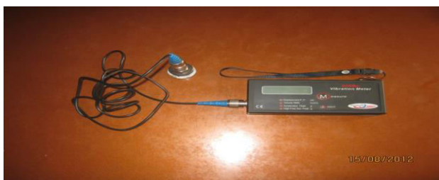
(c) A Vibration Meter, 908Be series