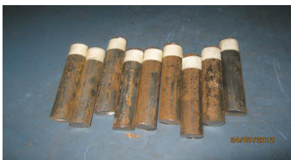
(a) 41Cr4 Alloy Steel Bars

0.65 Mn, 1.0 Cr) (Fig 1a); lathe machine with carbide (F30 Type) cutting tool of the dimension (25 x 25 x 12.5mm) type (HSS-718) with the following angles: back and side rake angle is 10°, 12° respectively, side relief angle is 5° and side cutting edge angle is 15°, using the standard angles as given in Jaton N. W. [19] (Fig 1b); A Vibration Meter 908Be series type measurement device (Fig 1c); and An Insize Surface Roughness Tester, ISR-16 type instrument (Fig 1d).