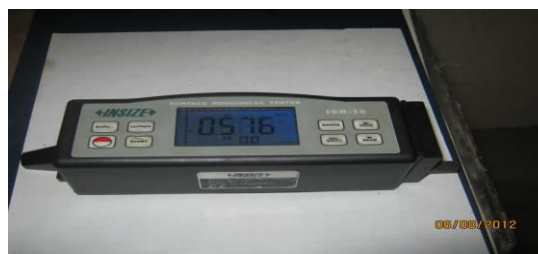
(d) An Insize Surface Roughness Tester, ISR-16 Series