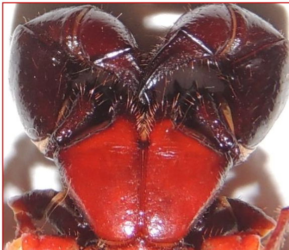
Figure 4. Pedipalp coxa showing maxillary process with tooth (ventral view)

Diagnosis of our specimen complies well with the available description provided by Pocock (1900). After proper diagnosis of the only specimen, we identified it as Thelyphonus sepiaris indicus (Stoliczka, 1873) (Uropygi). So far, up to our knowledge and on the basis of the known distribution, this is the first ever record of this species from Karnataka, India. Previous records of this species show that this taxon is well distributed in the south India.