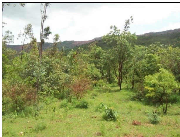
Figure 3. Habitat photo of the site locality

The specimen was collected from the forest track during afternoon, when it was under the rock. Generally it found under the medium size stones near humid places with full of leaf litter. We collected one specimen of this species from the habitat (figure 3), which composes typical southern tropical mixed dry deciduous forest type intermingled with scrub vegetation (Champion and Seth, 1968). The climate is generally hot and dry with maximum temperatures rising up to 45°C during May and drops down to 8°C in December. Average rainfall in this locality is about 900 – 1000 mm.