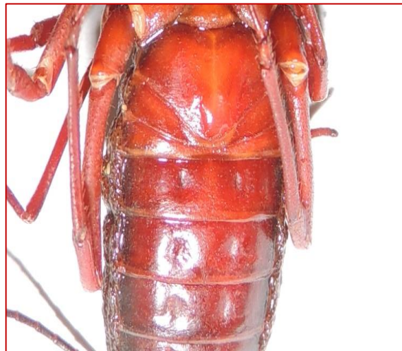
Figure 5. First abdominal sternum with its posterior boarder strongly and convexly produced, female (ventral)