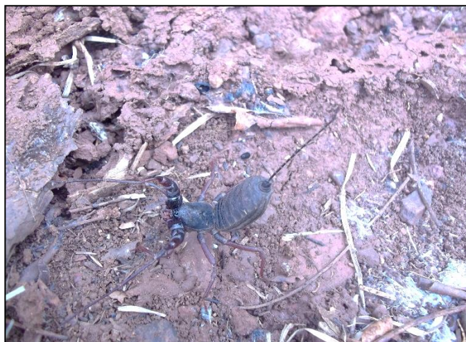
Figure 2. Thelyphonus sepiaris indicus (Stoliczka, 1873) in life