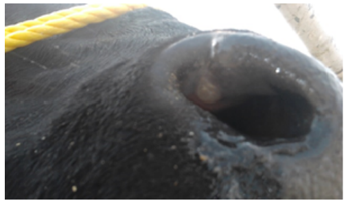
Figure 4. Vesicle in nostril (Patna).