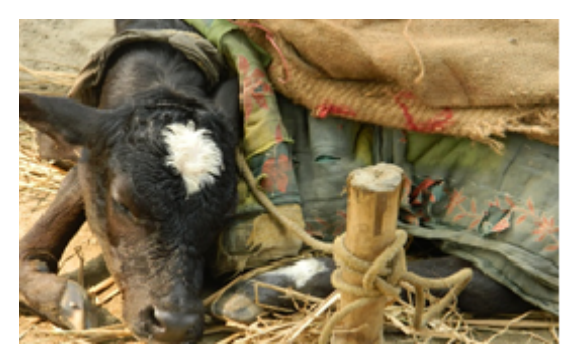
Figure 2. FMD Vaishali)affected calf.

In sheep and goats the lesion are often mild and may get unnoticed. In pig high fever accompanied with lesions in snout, lips nostrils, foot and lameness are predominant signs.