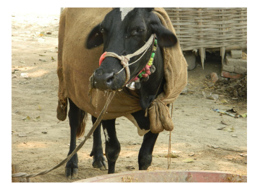
Figure 3. FMD affected cattle (Vaishali).