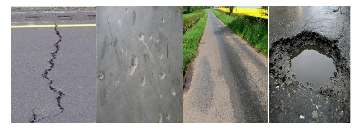
Fig : Example defects cracking, pop-outs, wear and polishing and potholes

The serve of automobile accident statistics in the world accounts that, despite the declining number of fatalities, the number of accidents readily increasing resulting in serious injuries or even death. The one of the major cause of traffic accidents is "Improper Driving" due to driver's inattention and fatigue. Also the other major contribution to these mishaps on roads is the increasing rate of defects on these roads. These defects are a result of the increasing amount of traffic and the climatic conditions, both of which can not be changed.