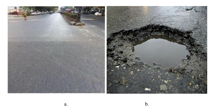
Fig: a) Plain Road and b) Pothole Road

Figure below specifies the image of plain road which is the reference image and the image of the pothole road.