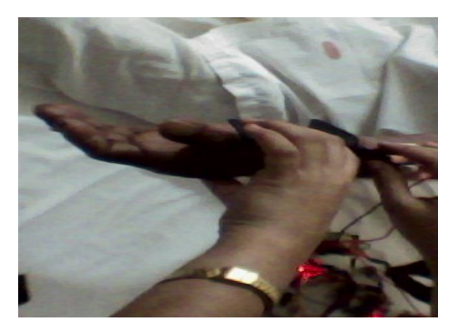
Fig 3b: Relaxation of the hand