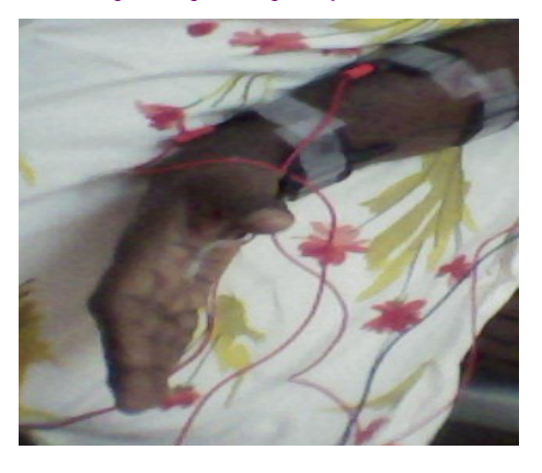
Fig 3a: Flexion of the hand