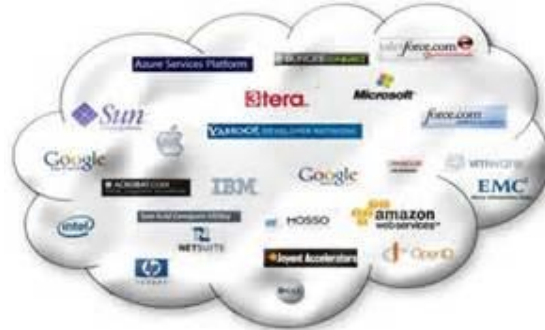
Figure 3 Cloud Service Providers

Department of CSE, JayShriram Group of Institutions, Tirupur, Tamilnadu, India on 6 th & 7 th March 2014