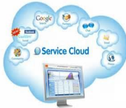
. Figure 4 Service Cloud Providers

Department of CSE, JayShriram Group of Institutions, Tirupur, Tamilnadu, India on 6 th & 7 th March 2014