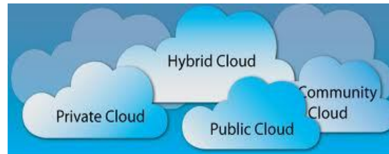
Figure 5 Cloud Deployment Models