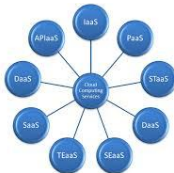
Figure 2 Cloud Computing Services

Amazon RDS service is charged in a utility computing manner, pay- per-use.