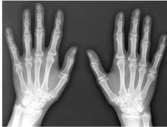
Fig. 2 Original scanned X-ray image of the human hand.