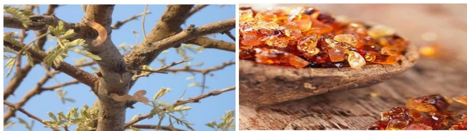
Figure 2. Gum acacia formation to the tree branch.

Acacia gum is not used as a real thickening agent. Its viscosity is low, even at high concentration (100 mPa s-brookfield at 25% in water), compared to other colloids such as modified starches or gelatine.