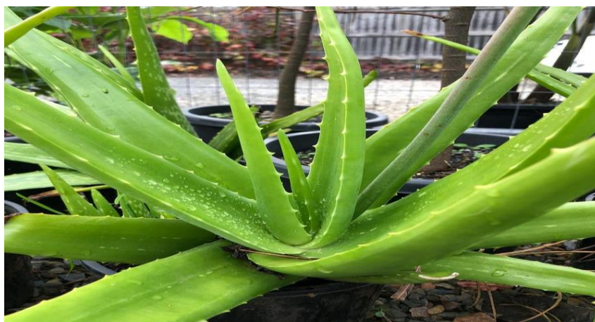
Figure 3. Aloe Vera .

Traditionally, this medicinal plant has been employed to treat skin problems (burns, wounds, and anti-inflammatory processes). Moreover, Aloe vera has shown other therapeutic properties including anticancer, antioxidant, antidiabetic, and antihyperlipidemic (Figure 3).