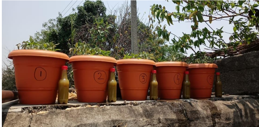
Figure 5. Ingredients are mixed and prepared organic formulation for organic farming.