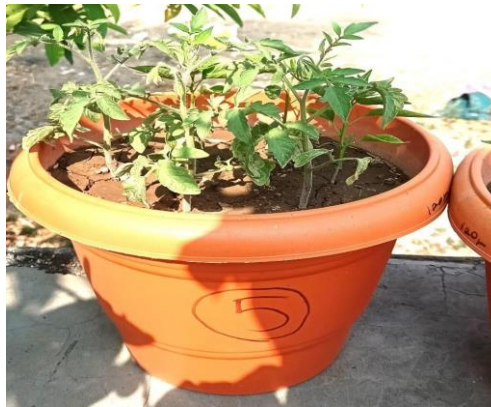
Figure 8. Result after using formulation.

According to the present study the results of the evaluation parameter shows that formulation no-5 had a significantly lower level insect, pest, viruses. From this investigation, it was concluded that the formulation of an herbal spreader insecticide and plant growth promoter contains all the good characteristics of an ideal insecticide, pest control, plant growth property and its environment friendly property.