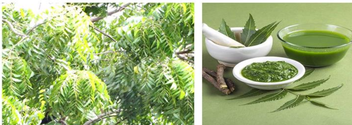
Figure 1. Neem tree.

Neem in crop management: Neem plays a vital role in crop and pest management. The use of neem in the form of neem fertilizers, insecticides, neem seed cake, neem pesticides, neem manure, neem soil conditioner, neem bio control agents etc., treat problems of significant field crops, pests in field crops. Neem helps in controlling the growth of pests and insects in crops, thereby helps in overall increased productivity of agriculture [6]. Neem is a well-known crop and pest manager, treating efficiently a large variety of crops and plants and also is an excellent insect/pest