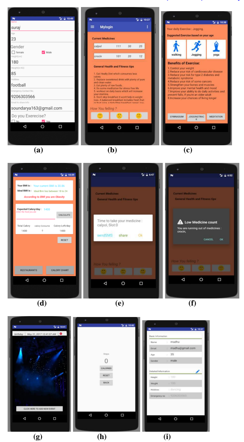
Figure 3: a) User entering data. b) Homepage. c) Exercise suggestions. d) Diet suggestions. e) Medicine alert notification. f) Low medicine count alert. g) Planner h) Calorimeter i) Edit information.