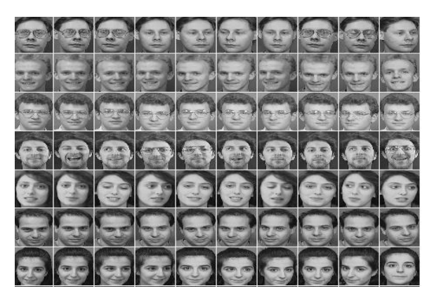
Figure 1. ORL Database of 400 images

The paper uses the image dataset called ORL Database. The ORL database totally consists of 400 gray scale images representing male and female gender. This images contains variations in lighting, facial expressions, pose, angles, age effects information. In this work, we collect 400 face images out of which 350 faces are male and rest 50 images are female.