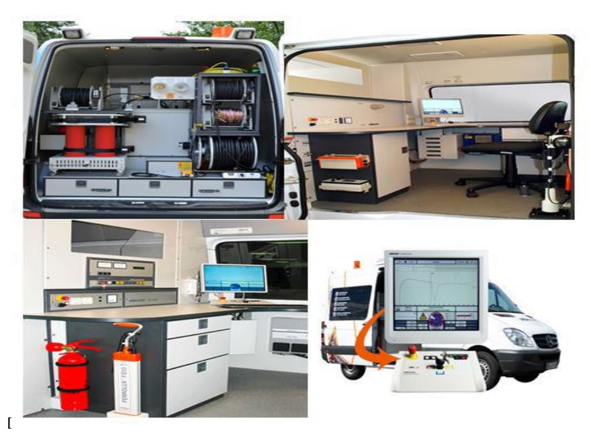
Figure 2: Centric system van for underground system cables faults.