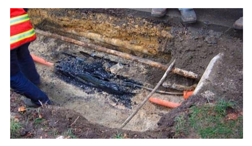
Figure 1: Example of underground cable fault.

Another type of cable fault is flashing fault. This type of fault does not manifest itself at lower voltages but flashes over at a certain higher voltage threshold. This may be several hundreds of Volts or several kilovolts up to a maximum which is the accepted dc test voltage for the cable. Such fault is acting like a spark gap. Lastly is the ingress of moisture. Moisture usually produces a contact fault involving all cores. Water enters in a cable at some point of damage and may reside in one limited stretch or it may spread many meters along the cable, typically as far as next joint [5] (Figure 1).