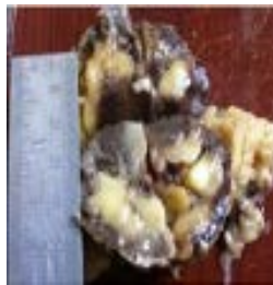
Figure 2. “Cut Surface of adrenal myelolipoma showing a variegated appearance of dark brown and yellowish areas.”