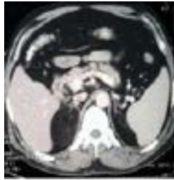
Figure 1. “Contrast-enhanced computed tomography (CECT) scan of abdomen revealed a well-defined, enhancing hypodense fat density lesion in the right suprarenal region suggesting the possibility of myelolipoma.”

by Meaglia and Schmidt in 1992. They proposed that myelolipomas arise due to metaplasia of the reticulo-endothelial cells of blood capillaries in the adrenal gland in response to stimuli such as infection, stress or necrosis [7].