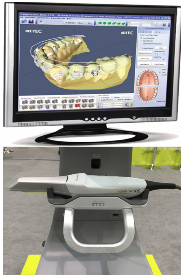
Figure 1. Shows the parts of Intra oral digital scanners – Computer monitor, Hand-held camera wand.