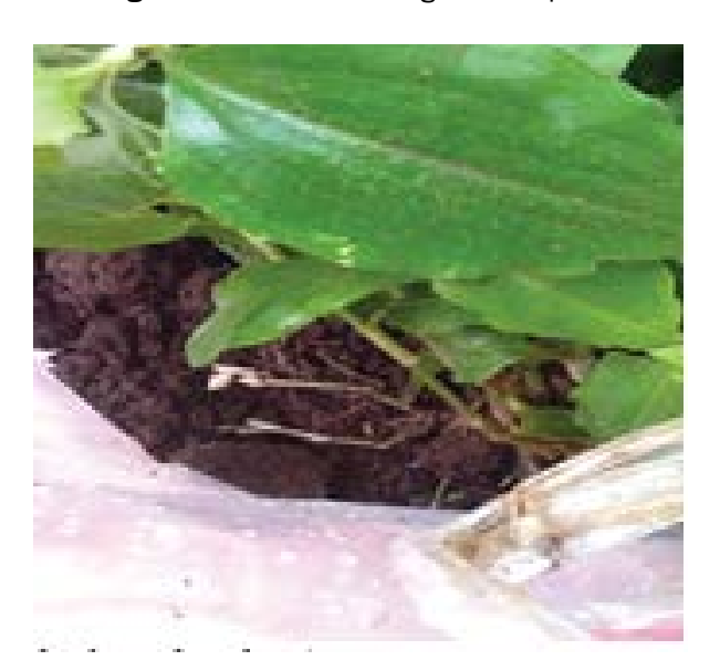
Figure 2. Commelina benghalensis plant.