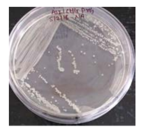
Figure 5: Isolation of single colony by four quadrant streaking method.