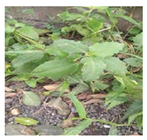
Figure 1. Commelina benghalensis plant.

The plant of C. benghalensis was collected from nearby Solapur areaand re-cultivated in college botanical garden (Figures 1 and 2).