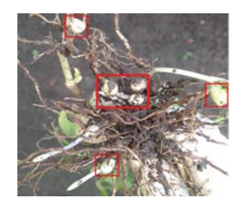
Figure 3. Dayflowers of commelina benghalensis.