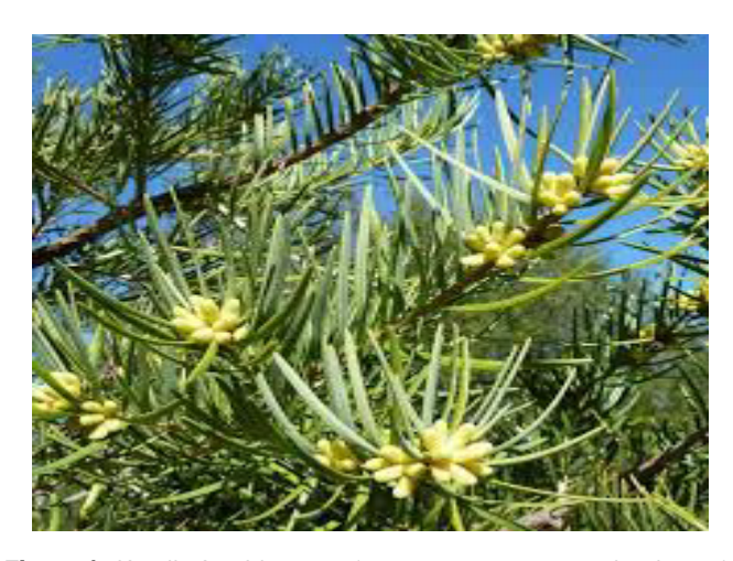
Figure 1. Ketellaria with cones (sources gymnosperm databases).