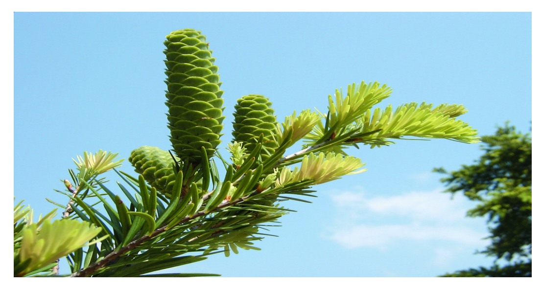
Figure 3. Branches of the Ketellaria gymnosperm with cones (sources IUCN plant list).