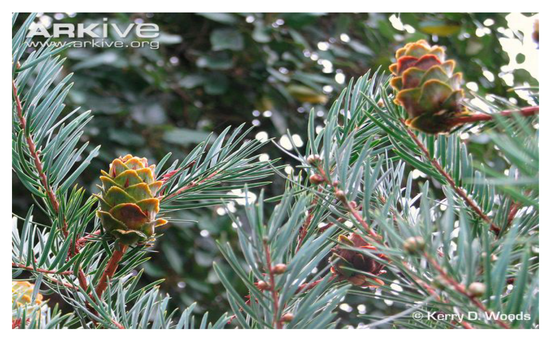
Figure 4. Emerging cones of the ketellaria (sources gymnosperm databases).