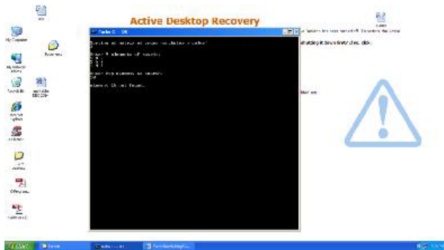
Figure 3. output screen shot of program.

element to be searched as input, divides the matrix into two parts. The first part is the lower triangular matrix including diagonal elements and second part is the upper triangular matrix excluding diagonal elements. BST1 is constructed by using first part of matrix and BST2 is constructed by using second part of matrix. Key element is searched in BST1, if found returns True otherwise key element is searched in BST2, if found returns True otherwise False is returned. The searching time of key element by using proposed algorithm is O(\log xy) where x is the number of nodes of BST1 and y is the number of nodes of BST2.