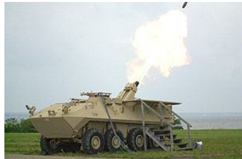
FIG 3. Dragon Fire

weapon used for indirect fire support. Dragon Fire is also expected to be effective in a counter-battery role.