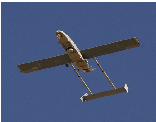
FIG 1 .The RQ-2 Pioneer

The RQ-2 Pioneer is an unmanned aerial vehicle (UAV) that had been utilized by the United States Navy, Marine Corps, and Army, deployed at sea and on land from 1986 until 2007. Initially tested aboard USS Iowa (BB-61), the RQ-2 Pioneer was placed aboard Iowa -class battleships to provide gunnery spotting, its mission evolved into reconnaissance and surveillance, primarily for amphibious forces. It was developed jointly by AAI Corporation and Israel Aircraft Industries. The program grew out of successful testing and field operation of the Tadiran Mastiff UAV by the American and Israeli militaries. Essentially, the Pioneer is an upgraded Tadiran Mastiff which was re-engined to accommodate a greater payload by request of the US Navy. To accomplish this, the original "Limbach" two-cylinder two-stroke engine was replaced with a Fichtel & Sachs two-cylinder two-stroke. The Limbach motor utilized a 28 inch propeller from Propeller Engineering and Duplicating, Inc. of San Clemente, California. The newer, more powerful Fichtel & Sachs motor was outfitted with a 29 inch propeller (which spins in the opposite direction) from the Sensenich Propeller Manufacturing Company of Lancaster, Pennsylvania.