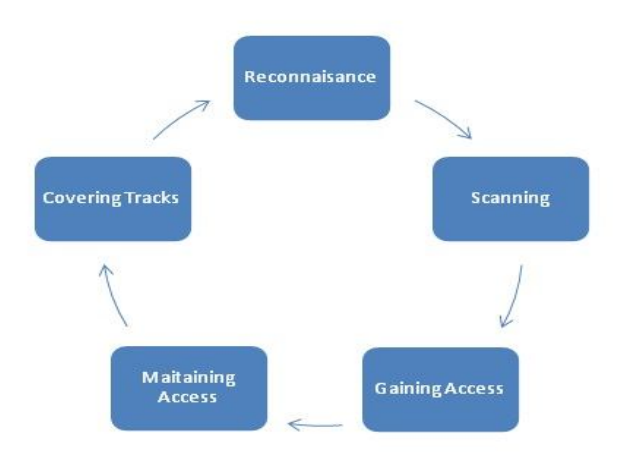
Fig. 2: PHASES OF HACKING

The overall hacking methodology consists of bound steps that square measure as follows: