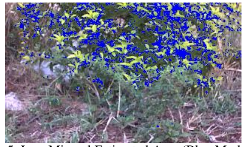
Fig 5: Low Mineral Estimated Area (Blue Marked)