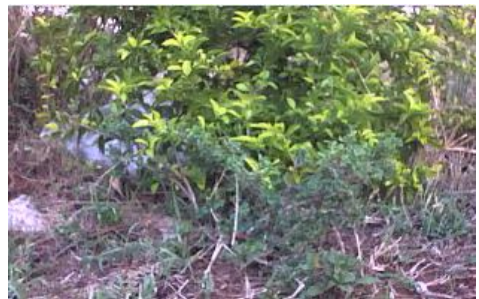
Fig 4: HD Camera Captured Image

Influenced leaf ID is recognized by catching the picture of the plant utilizing remote camera from the sky if there is any shading change in leaf color and example choose then the signal goes to shower pump and it will splash organic pesticides to the plant.