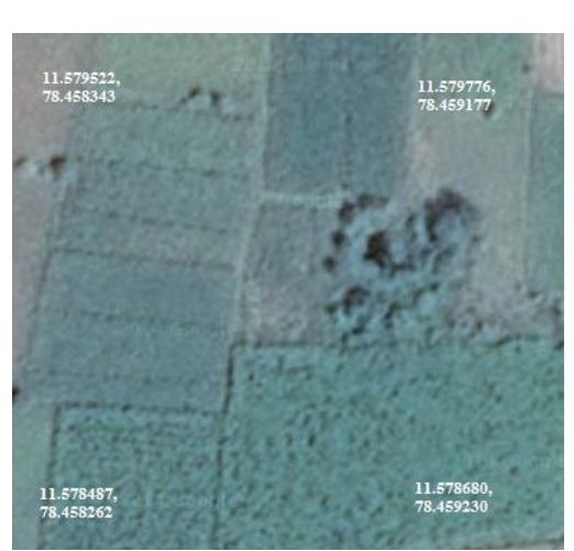
Fig:3 Topview of the field from Quad copter

(An ISO 3297: 2007 Certified Organization) Vol. 3, Issue 4, April 2015