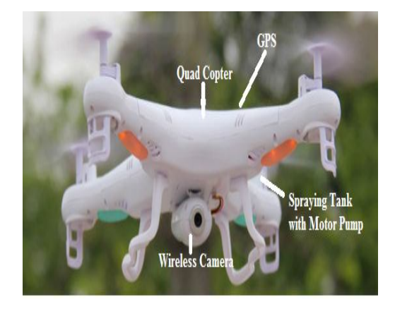
Fig:2 Quad copter Representation

Here the GPS used to fly the quad copter within the land area. This 64 channel GPS can control the quad copter with in the land by using predefined signals from satellite Longitude, Latitude and Speed it act as a tracker of Quad copter. 2.4 GHz wireless communication with 4 channels is used between Quad copter and Controlling devices. Pest affected leaf or plant identification is done by using wireless HD camera if there is any variation in plant color then the organic pesticide will spray using motor spray pump.