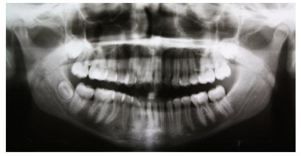
Figure 6. Post-treatment radiographs.