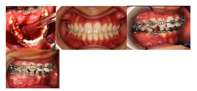
Figure 4. During surgical exposure procedure and photographs of following visits.