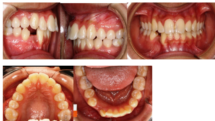
Figure 2. Pre-treatment Intra-oral photographs.