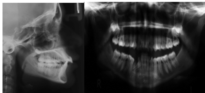
Figure 3. Pre-treatment radiographs.