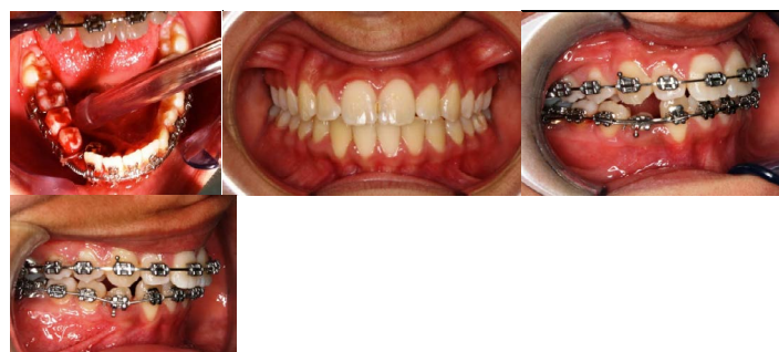
Figure 4. During surgical exposure procedure and photographs of following visits.