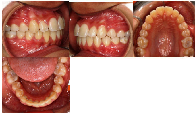
Figure 5. Post-treatment Intra-oral photographs.