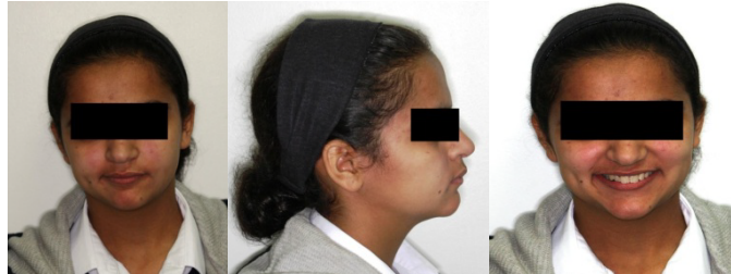
Figure 1. Pre-treatment extra-oral photographs.

preventing its eruption ( Figure 3 ). The treatment plan was to initiate a fixed orthodontic appliance therapy to create more space for the mandibular canine then carry on a surgical exposure procedure to uncover the tooth and enable its traction through the orthodontic appliance using an 0.22 inch slot, MBT prescription. Treatment started with leveling and alignment through 0.14 and 0.18 inch Nickel Nitatinum wires. Furthermore, the treatment continued through 0.19x0.25 NiTi and Stainless Steel archwires to achieve the treatment objectives ( Figure 4 ). A retention regime was also planned which included a fixed retainer in the lower arch to minimize the risk of relapse of the impacted canine after alignment plus an upper and lower removable retainers.