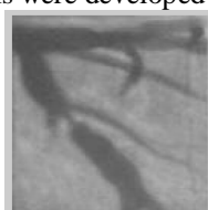
Fig:2, Input image for compare K-means and IM K-means

To test the algorithms thoroughly, separate programs were developed for IMK-means and conventional K-means.