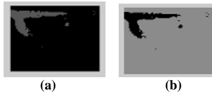
Fig: 3, output of K-means at cluster value 4 in (a) and 5 in (b)

For compare K-means and IM K-mean the input image has been shown in the fig 2. It can be compare with different cluster numbers in these algorithms. The results are shown in following diagram.