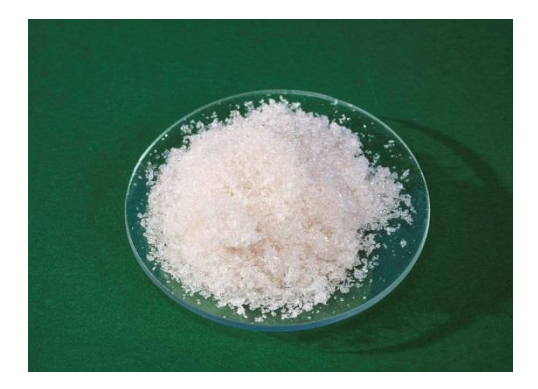
Figure 2: Solid form of phenol