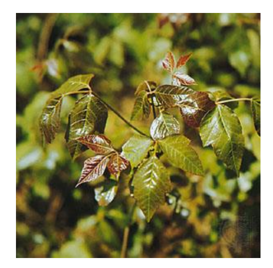
Figure 1: Poison ivy (Toxicodendron radicans) is a natural source of the phenol ... Walter Chandoha