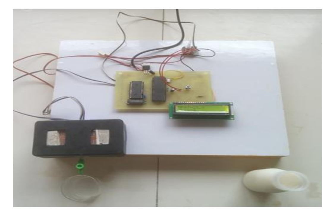
Fig.2. Proposed method