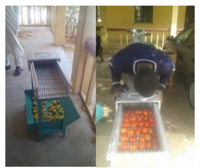
Figure 1: Modified and Old manual tomato slicing machines.

Experiment to study the effects of processing conditions on the performance of the tomato slicing machine was carried out at Nigerian Stored Products Research Institute, (NSPRI), Kano, Kano State, Nigeria, where the modified manual tomato slicing machine was developed.