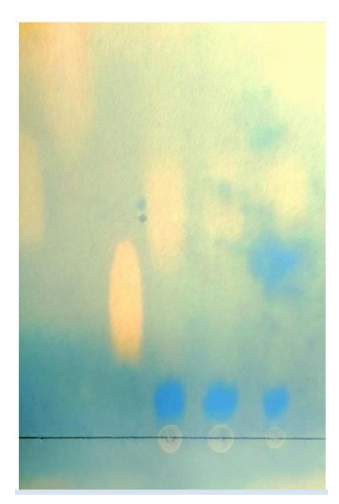
Figure 4. TLC of fermented wine samples.

In this yellow color is developed against blue background in the sample 4, dark yellow color is seen which shows that the sample 4 is have completed full fermentation when compared with other samples.