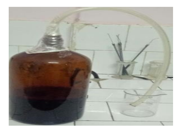
Figure 1. Fermentation setup.

Fermentation of wine is carried out in lab by making a simple set up of fermenter in a lab by using lab equipment's i.e., 5 liter of empty brown bottle and distillation pipes and paraffin are used for the preparation of wine and the setup is kept in a dark room for up to 6-10 days (Figure 1).