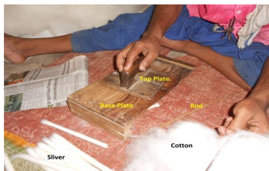
Fig.2 - Recent manual method of producing sliver (Pelu).

In olden days slivering process was done with a bow like instrument to fluff cotton and to create rolls called slivers. These are handmade and kept in dried banana stems to use to produce the thread. Till date same process is adapted to produce sliver with minor changes .Fig.2 shows the hand tool used for sliver producing in Main center of Maharashtra Khadi Udyog , Sewagram, & Gram Sewa Mandal, Gopuri, Wardha.