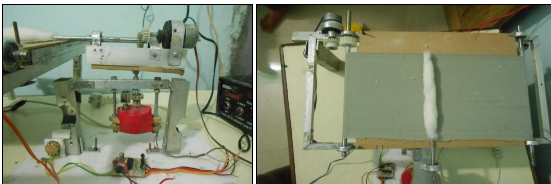
Fig.5 - attachment for producing Sliver.

The output of the main cylinder is then connected with the help of duct to the attachment as shown in fig.5., Which is having two revolving rod in between the two steady wooden plates. This is rotate with the help of stepper motor. The hook is used to remove the sliver from rod.