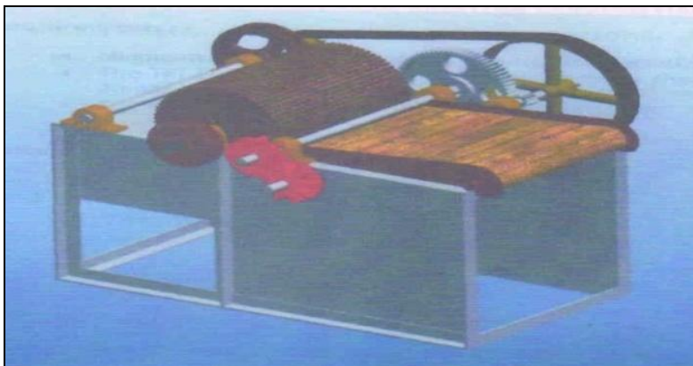
Fig. 4 – Mechanism for carding

To solve above cited problem we have developed a mechanized system as shown in fig.4. In which the main carding roller is use for opening the fiber of cotton. Which is having number of teeth on its periphery as shown in fig. and having speed around 1440 rpm. Cotton fibers fed to the card by feed conveyers are separated from the batt in tufts by the lickerin. From the lickerin they are transferred to the main cylinder which moves opposite direction with respective to the lickerin.