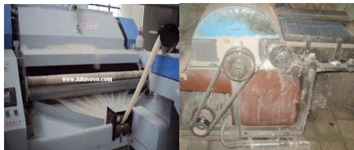
Fig.3 - Carding Machine.

Fig. 3 shows the Carding machine used in both textile industry and in Pinjanalaya.