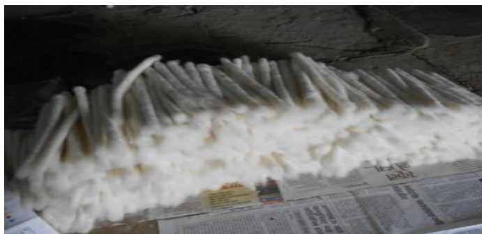
Fig. 1 – Sliver (Pelu)